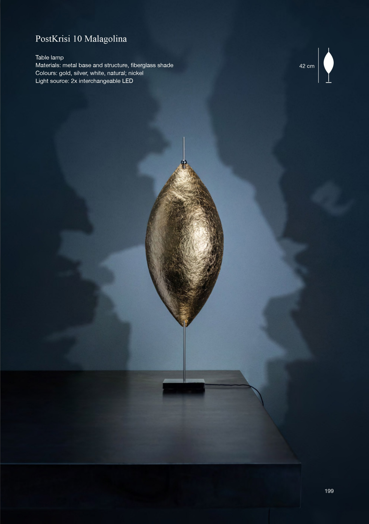
PostKrisi 10 Malagolina Custom version for Hotel de Paris - Monte-Carlo